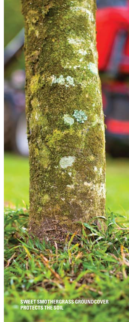
SWEET SMOTHERGRASS GROUNDCOVER PROTECTS THE SOIL