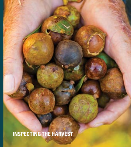
INSPECTING THE HARVEST

Water flows through the Emigrant Creek catchment to Emigrant Creek Dam.