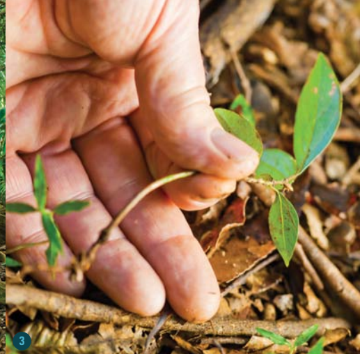
1. NATIVE STINGLESS BEES 2. BLUE FIG ( Elaeocarpus grandis ) 3. WEED REMOVAL 4. THE RAINFOREST CANOPY 5. BLUE FIG SEED 6. FUNGI ON THE FOREST FLOOR