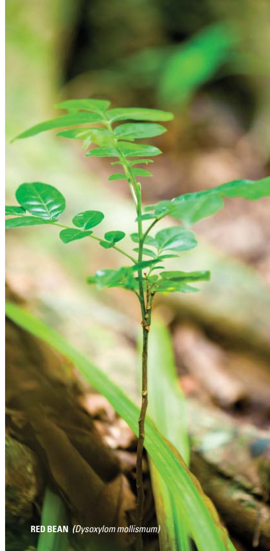
RED BEAN ( Dysoxylum mollissimum )

Eucalyptus trees planted at the North of the property provide a home for several breeding pairs of owl. These birds of prey consume around 1200 rodents each per year. The snakes from the forest floor take care of the rest. He uses a natural approach to pest management in the orchard. He works closely with the Department of Primary Industries and the University of Queensland using known biological control methods, as well as trialling new and innovative approaches to combat pest-insect problems.