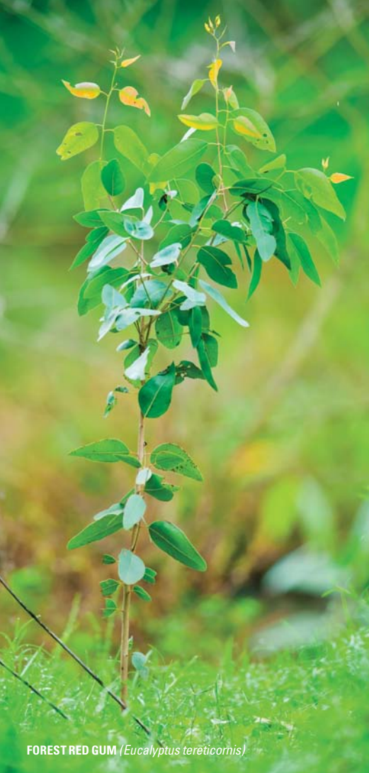
FOREST RED GUM ( Eucalyptus tereticornis )

The challenges of planting in this section of the Wilsons River have included flood and frost. In order to overcome these obstacles frost hardy species were selected along with those that could survive periods of inundation by flood. These plantings provide a framework for less hardy species to be introduced in the future.